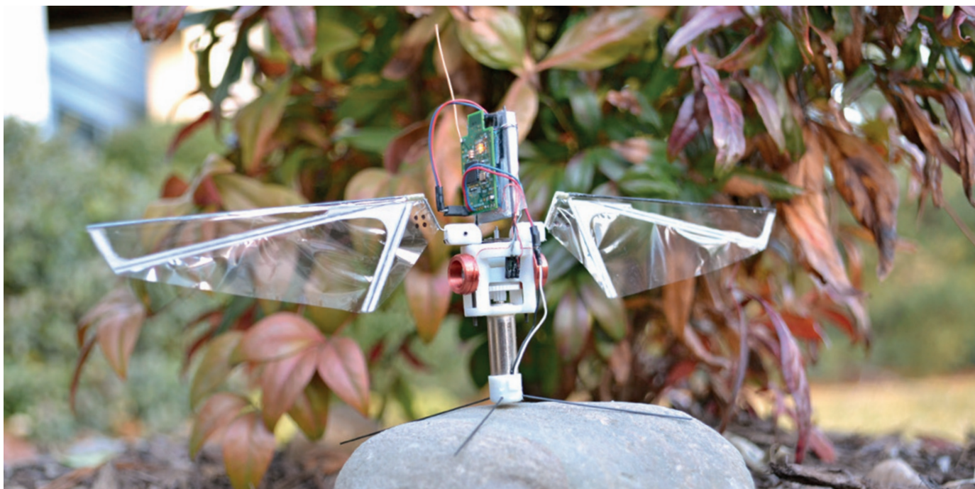
PAUL D. SAMUEL, DAEDALUS FLIGHT SYSTEMS, LLC &amp; J. SEAN HUMBERT, UNIV. MARYLAND

An imitation insect, called a 'flapping wing micro air vehicle' does not resemble a bee, but it can hover in the air, turn rapidly and take off easily.